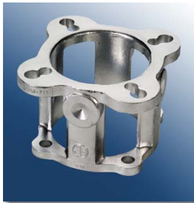
Dual ISO Holes